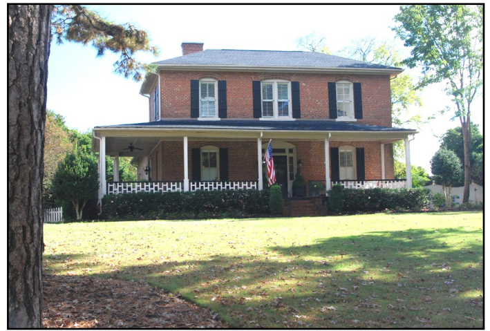
THE MACK-BELK HOUSE

Tour space is limited and some are already sold out. Reserve your place at www.fmhm.org or by calling 803-802-3646. Ticket cost is $35 for the basic tour and $45 for the special tour that includes Colonel Springs' office.