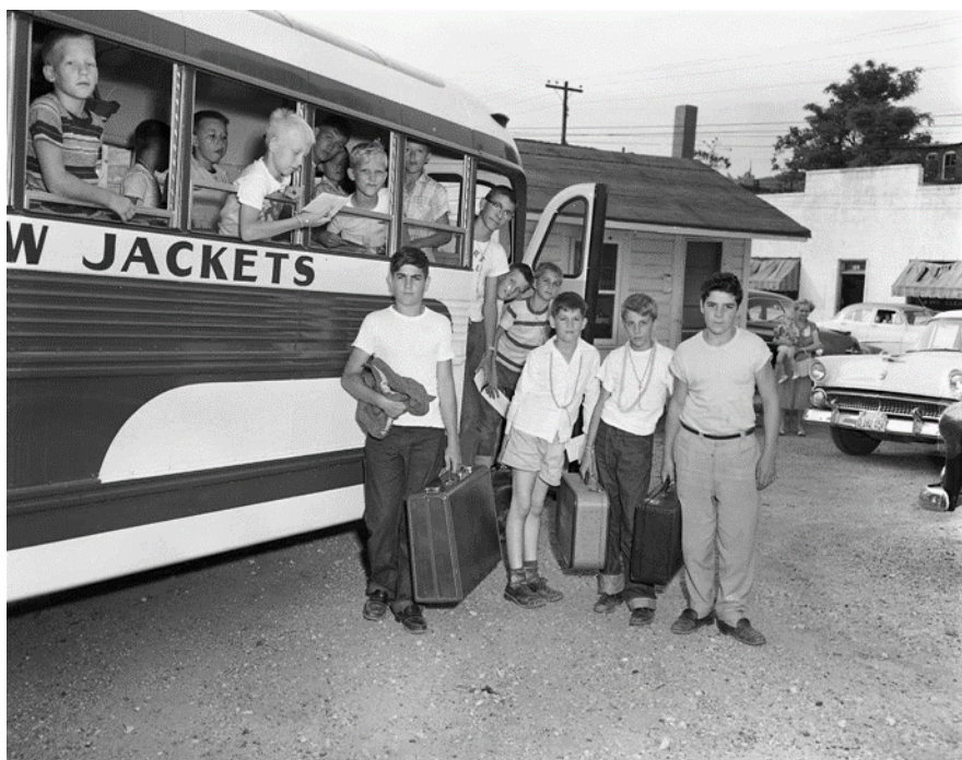
This picture, taken in the 1950's, and shows members of the safety patrol disembarking from the school bus in Fort Mill after a week at Springmaid Beach.

This photo from the late 1950's shows the well-tanned Safety Patrol arriving back in town after one such beach trip. Do you know any of these guys? If so, let me know at michaelcasehill@yahoo.com .