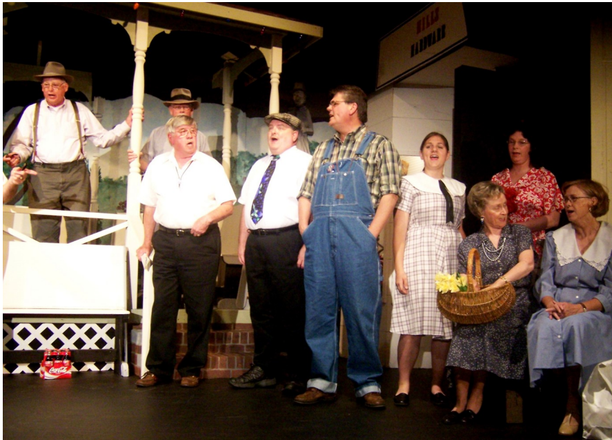
Bandstand Tales , performed for three seasons (2006, 2007, and 2010), is a musical history of Fort Mill told from the Fort Mill's most famous landmark.

The theater will launch its 36th season with the play Honky-Tonk Angels beginning March 3rd with performances through March 20th.