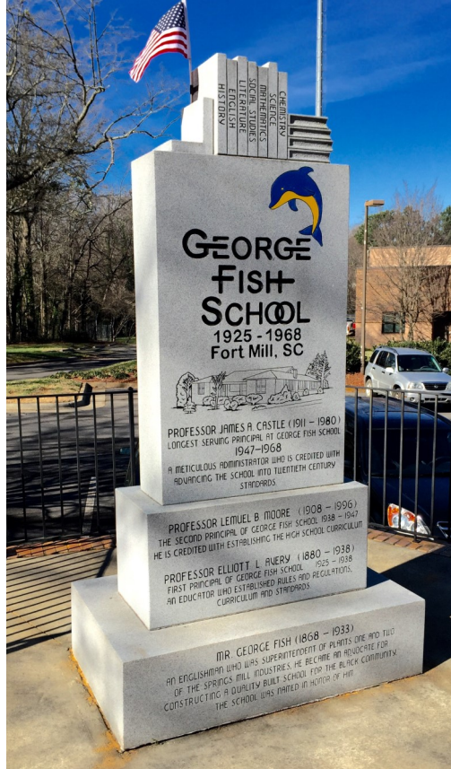
The monument pictured above, erected in 2007, stands at the former site of George Fish School, which opened in 1925 and served the Paradise community for nearly 45 years.

Over 5000 Rosenwald Schools were built throughout the South and one grant provided the starter funding for George Fish School.