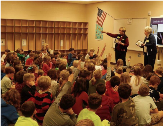
Museum volunteers present local history in the classroom.

This unit includes a field trip to the Ann Springs Close Greenway and the Museum. After lunch in Walter Elijah Park, students then travel to Confederate Park where they learn the history of the unique statues.