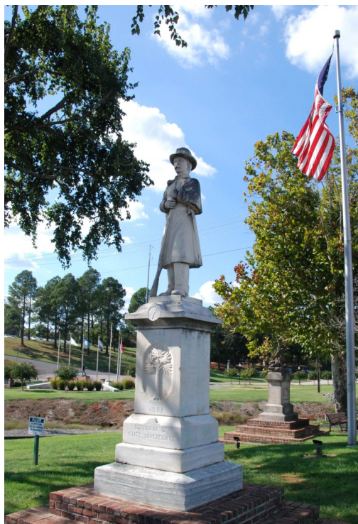
Tribute to soldiers of the Confederacy, Confederate Park, Fort Mill.