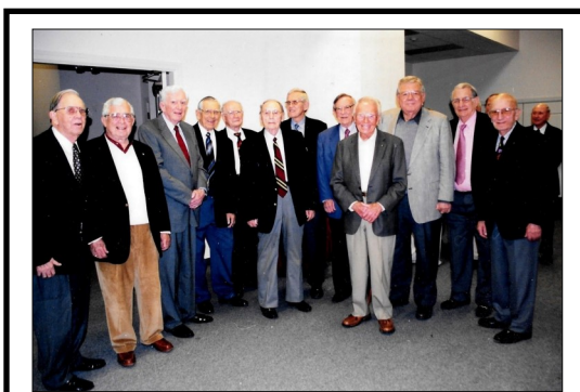
From Last Month's "Do You Know?"