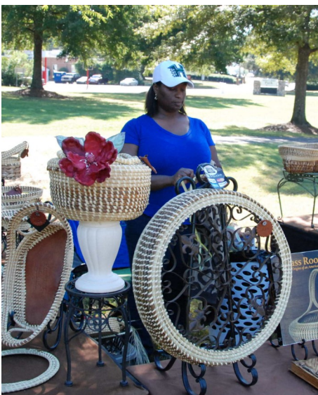
Beautiful baskets and other items are crafted by hand of sweet grass in a weaving process developed in our Low Country .

With re-enactors demonstrating the uniforms and daily life of their eras, demonstrations with herbs, tools and crafts produced by early pioneers and even a glimpse into the ¾ scale model of the Hunley submarine, students gained an up-close, hands-on experience of the people and events they study in class.